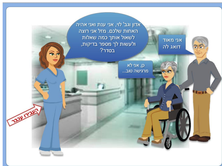
Fig.2: Screenshot from patient scenario about differential diagnosis using Articulate Storyline software